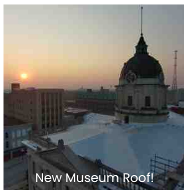
New Museum Roof!