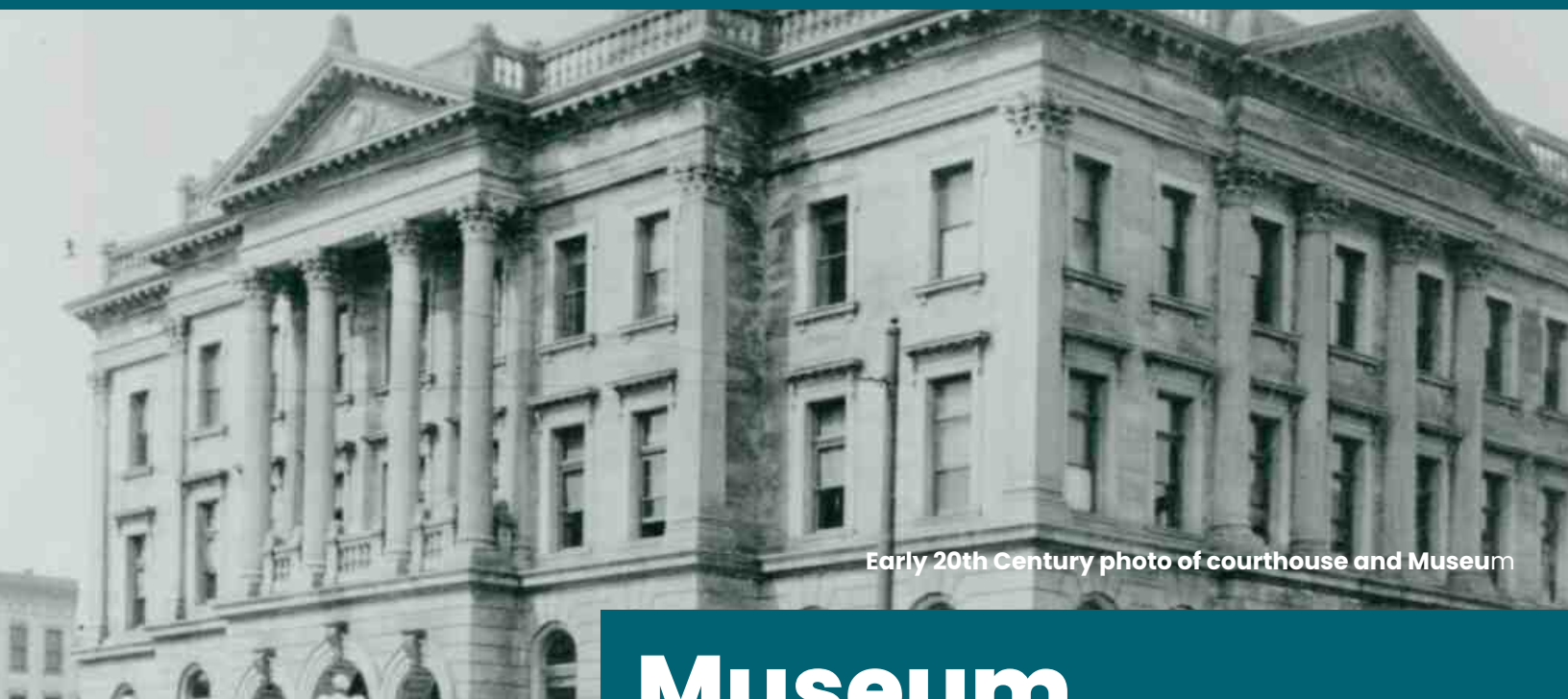
Early 20th Century photo of courthouse and Museum