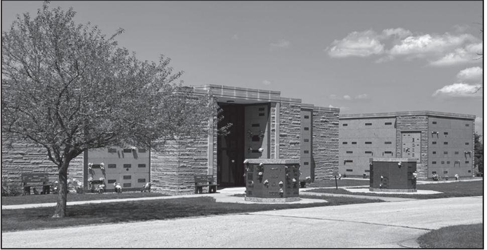
One of three multi-story mausoleums that were constructed over the years, the earliest being in the 1960s.

Cemetery features include three multi-story garden mausoleums, two columbariums, Italian white granite statues scattered throughout the cemetery, and an ossuary for cremated remains.