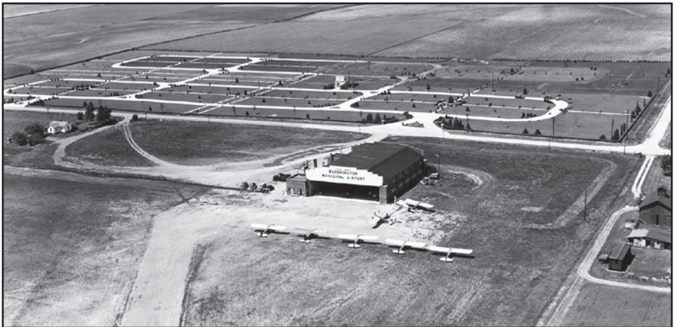
Aerial view of Bloomington Municipal Airport looking northwest shows the main hanger and East Lawn Memorial Gardens, June 20, 1941.

When East Lawn was founded in 1935, it was located two miles east of the city limits and just west of the new municipal airport on highway Route 9. R.F. Beeler of Burlington, Iowa developed the cemetery after purchasing a 30-acre-tract of land from Fred Young that year. Frank Howell was listed as the authorized sales agent for lots in the cemetery.