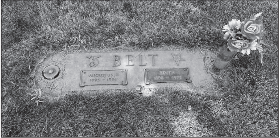
Augustus "Gus" Belt and Edith Belt's grave, located in section 1, Lot 50 5 and 6

Our guest voices for this year's Walk, Gus and Edith Belt, are visiting from East Lawn Memorial Gardens and Cemetery, located at 1002 Airport Road in Bloomington.