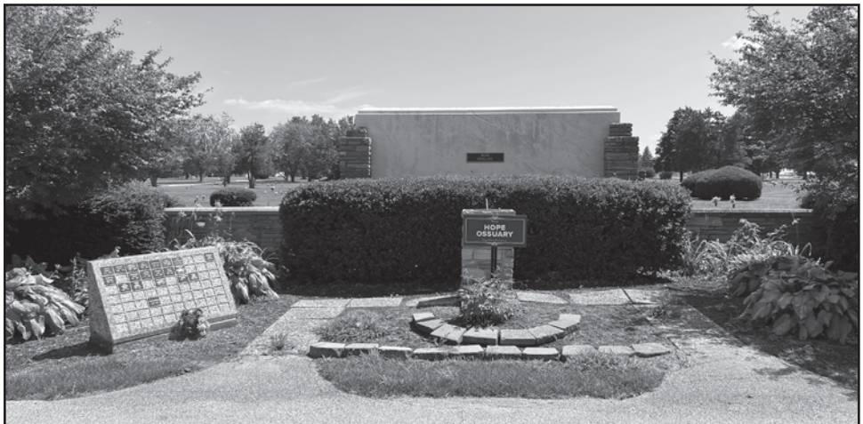
This ossuary holds cremated remains and takes the place of a scattering garden at East Lawn.

Cemetery ownership has changed hands several times over the years and is currently owned by Service Corporation International, a member of the Dignity Memorial Network, North America's largest provider of funeral, cremation, and cemetery services.