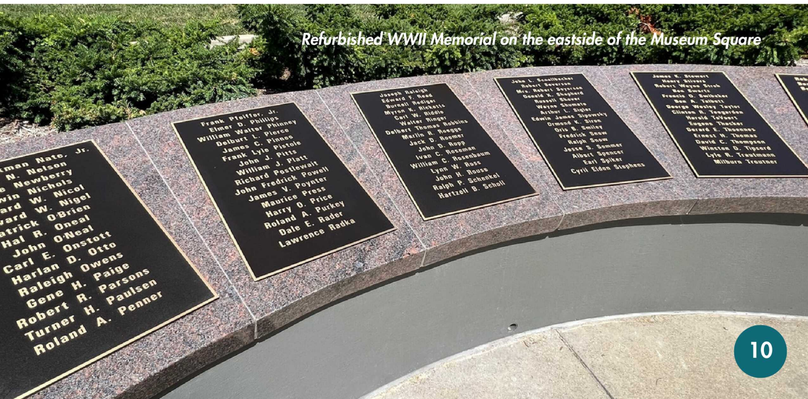
Refurbished WWII Memorial on the eastside of the Museum Square