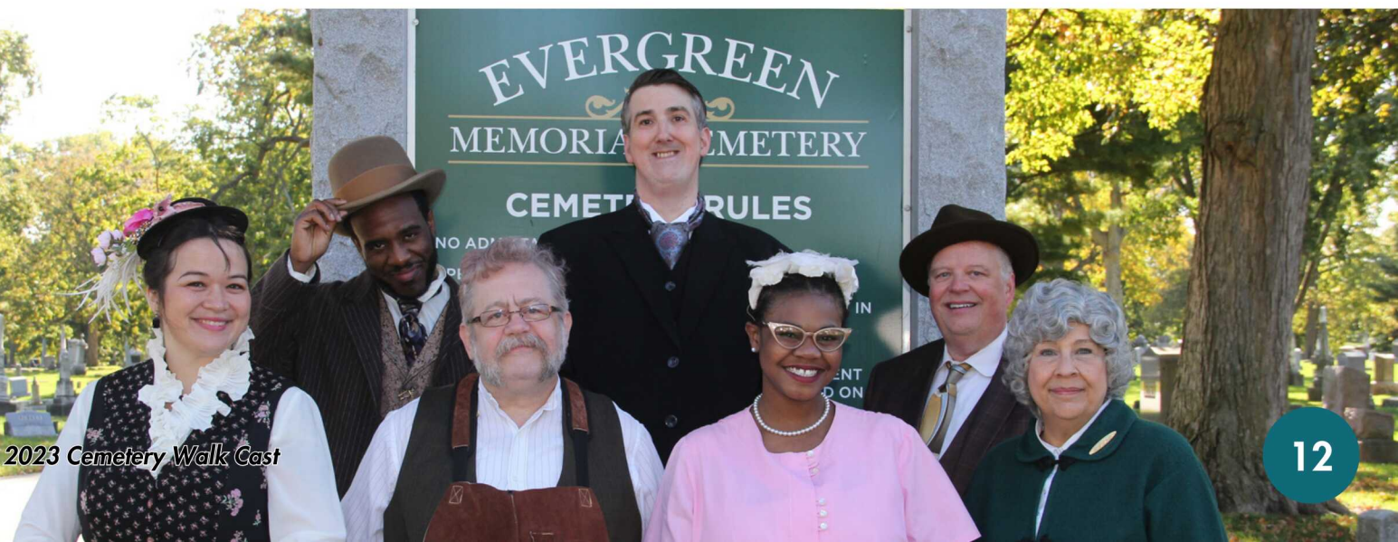
2023 Cemetery Walk Cast

Looking to the future, the Museum received a grant from Illinois Humanities to fund our Spanish language audio tour of the Making a Home Gallery. The Education Department is collaborating with other Museum staff and a committee of community members to bring the tour to life in November 2024.