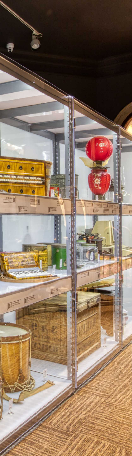
Photo from the recently reopened and reimagined Merwin Gallery which features over 300 rarely seen objects from the collection.